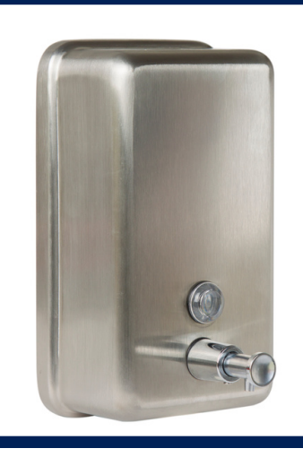
Vertical Soap Dispenser Code: ML605AS_N