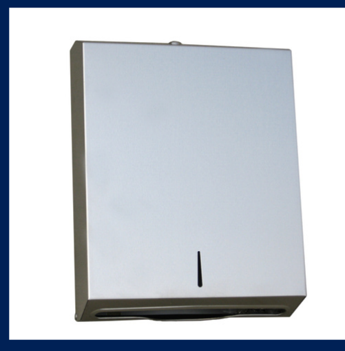
Paper Towel Dispenser -Stainless Steel