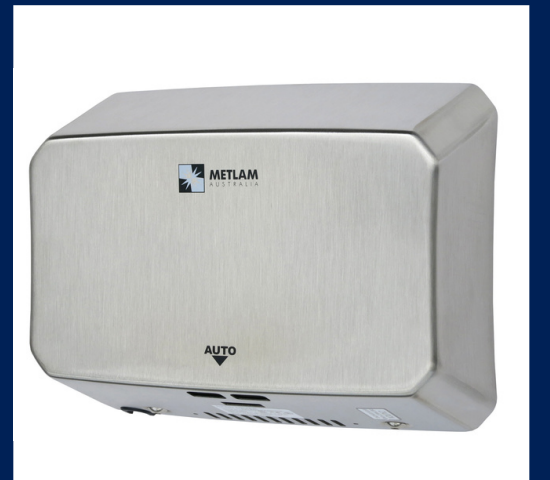
Eco Slender SS Code: ML_ECOSLENDER05_SS