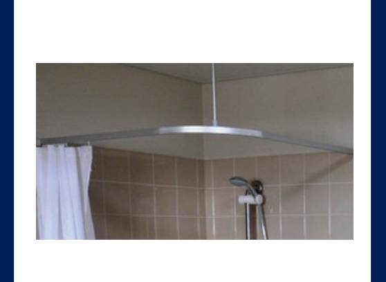
L Bend Modular Shower Curtain Track System