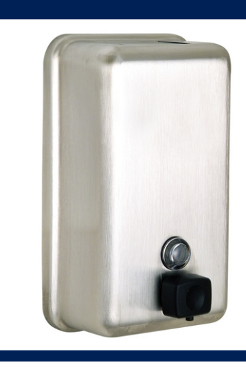
Vertical Soap Dispenser -Button Pump Valve Code: ML605BS