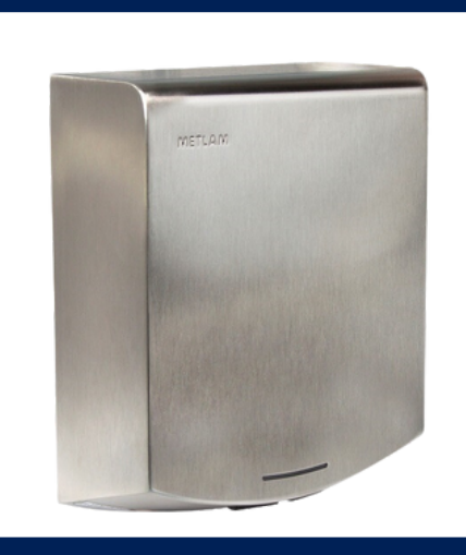
Eclipse Slimline Auto Hand Dryer Code: ML_ECLIPSE05_SS