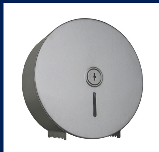
Jumbo Toilet Roll Dispenser Code: ML841