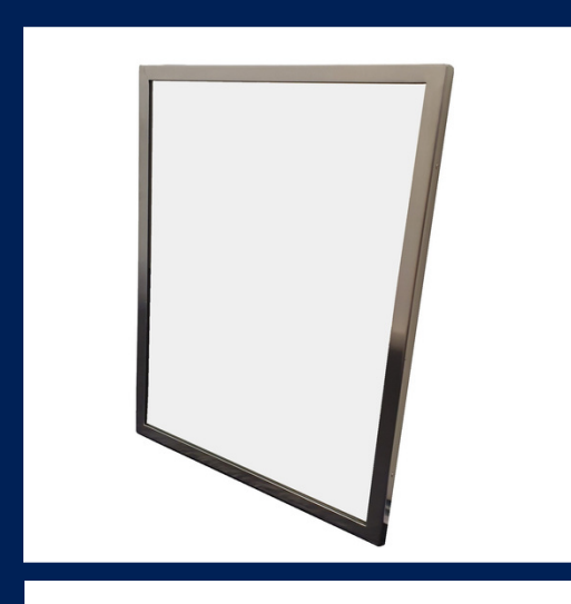
Framed Mirror Stainless Steel - 450mmW x 1000mmH